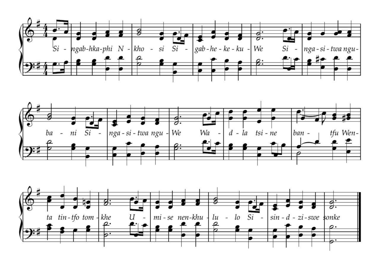
S284-2. Siswati Lyric

1. Singabhkaphi Nkhosi, Singabheki kuWe?